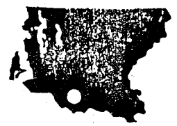
MAP 5. Community planning area.